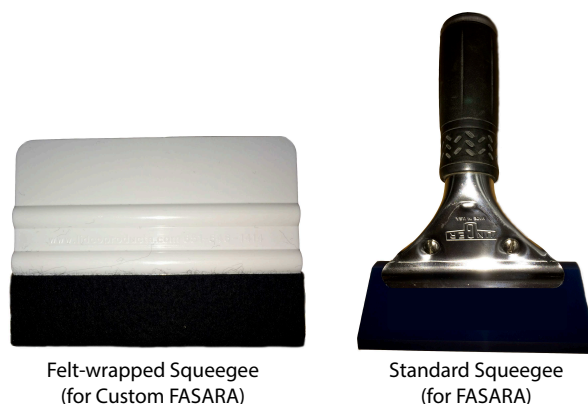
Figure 1. Felt-wrapped and rubber squeegees for FASARA installation