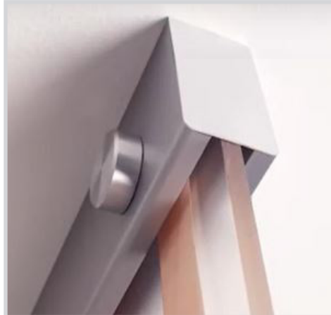
Finished Standoff Cap & End Cap