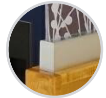
Finished with End Cap

End caps can be added to cover the end of the channel to create a finished end. The exposed ends of the C-Channel are covered with stainless steel adhesive caps.