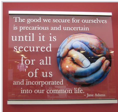
St. Joseph High School (SL-EBSQ)