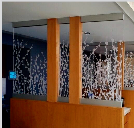
C-Channel with Finished End Cap