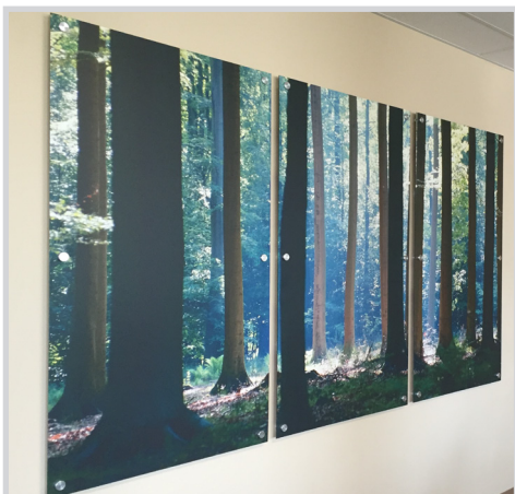
Beacon Health System