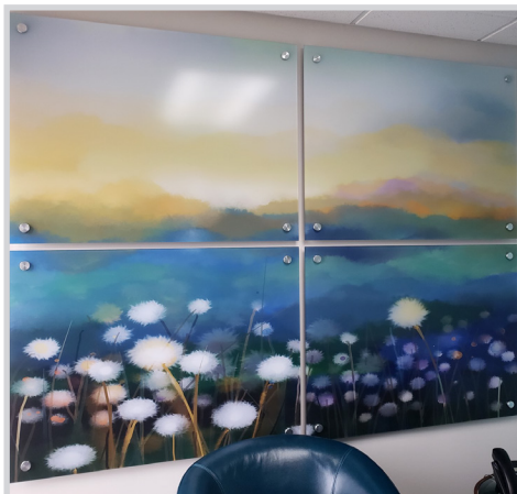
Valley Screen Lobby