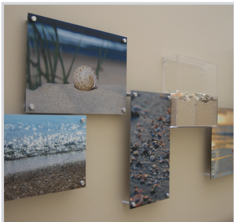
Main Street Med Point Art